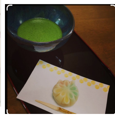
Let's experience a tea ceremony as a guest!