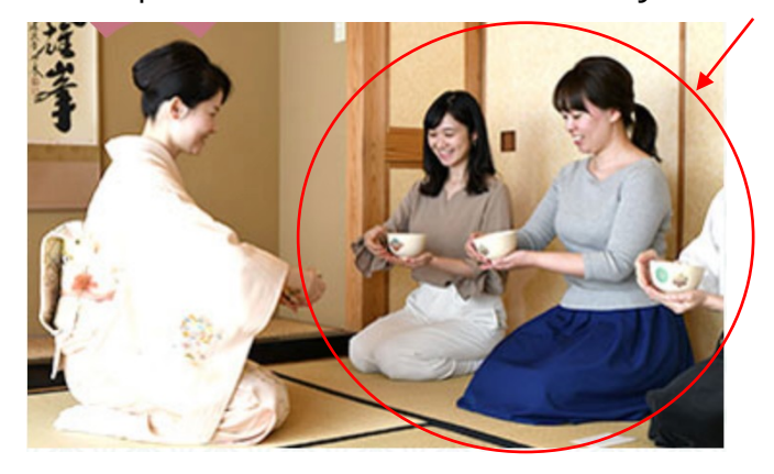
You can enjoy matcha in about 10-15 minutes.