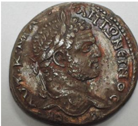
Caracalla silver coin (AC.188~217)